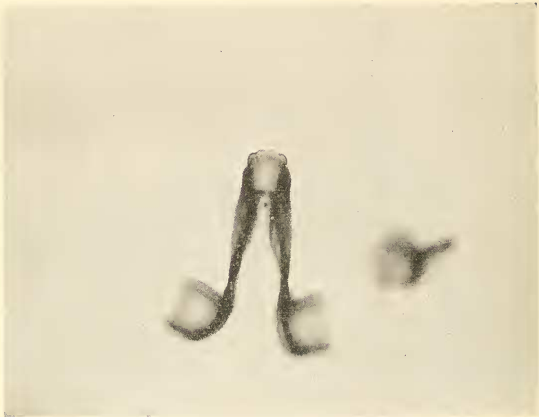
Fig. 4, Micrograph of mesosome of type male.

Type .—One male, the terminalia dissected and mounted on a separate slide.